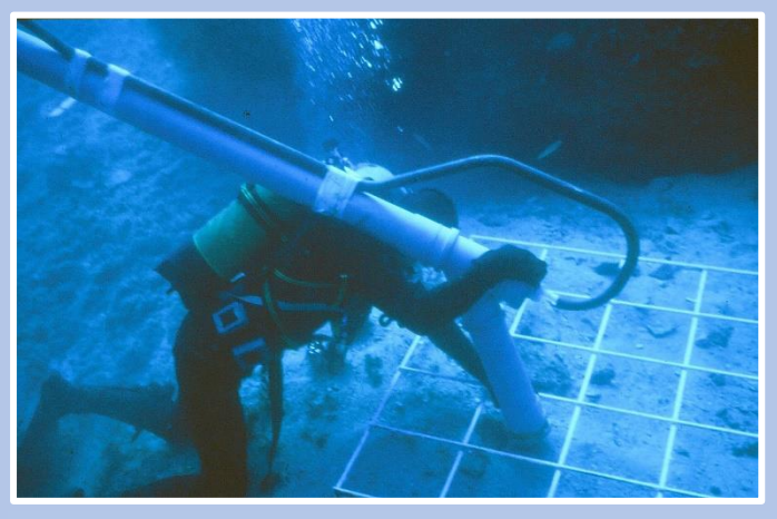
Diver using a water dredge to excavate a carefully gridded wreck site

It is in the excavation phase that the diving archaeologist enjoys an advantage over his/her land-based colleague. Unless blessed with superpowers, the