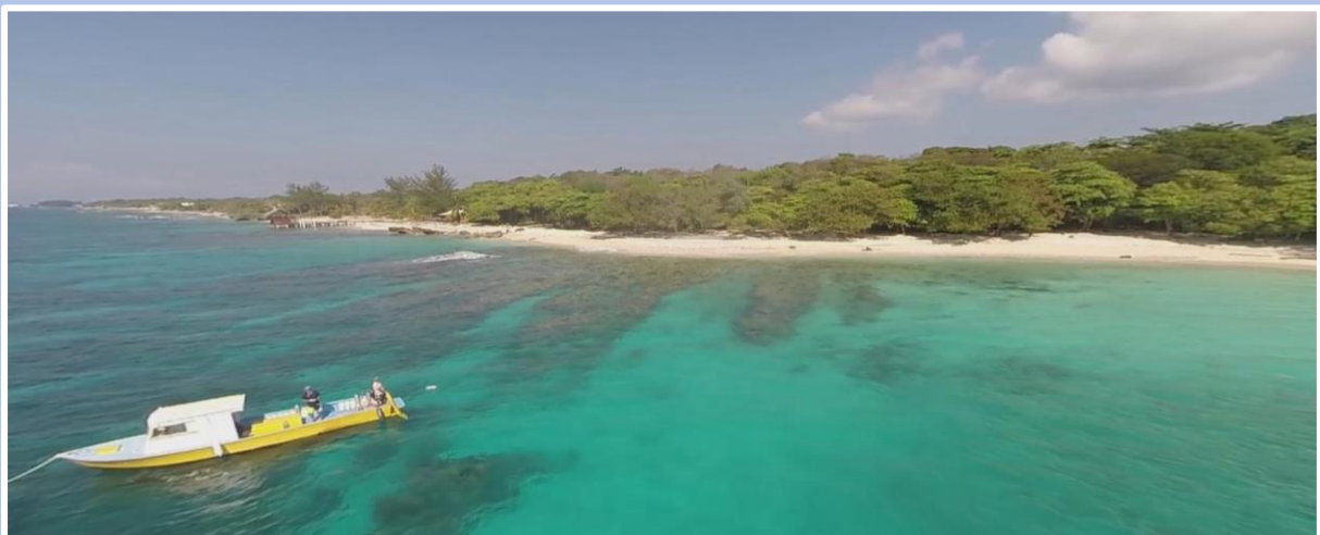
The crystal-clear water of Utila, Honduras

The plan is to be on site in Utila from July 18 th to September 9 th , 2022, so eight weeks. The general objectives will be the same: