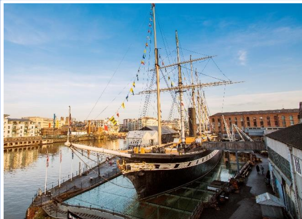
SS Great Britain, pride of place in Bristol Harbour

along if you can. Go Diving, which attracts more than 100 exhibitors from around the world, is an interactive show, offering something to both seasoned and newly trained divers. With the exhibition space spread over two purpose-built halls and plenty of parking it is an ideal venue for such a show. With new equipment from the biggest brands, skills workshops, keynote speakers, interactive experiences and exhibitors from all areas of diving it promises to be an event not to be missed. Tickets available https://www.godivingshow.com